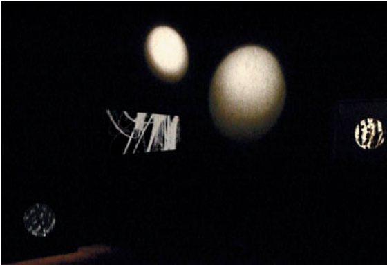
Composite of projection details from Amy Granat's three-film installation Stars Way Out (for O.K.) , 2006. Photos: Amy Granat

NEW YORK–BASED ARTIST AMY GRANAT makes films but generally dispenses with the camera, producing images by damaging film emulsion through direct manipulation. Or, as she put it in a recent interview, “Whatever kind of assault you can make on film material, I’ve done.” Her first such attacks were carried out when she was studying for her BA at Bard College in Annandale-on-Hudson, New York, in the late ’90s; working in total darkness, she would dump a spool of 16-mm stock into a bathtub full of (highly toxic) chemicals, then mash and grind the film against itself. Around the start of the current decade, Granat developed a somewhat more controlled and less hazardous process that involves manually scratching the film (always 16 mm), using razors, hole punches, and other tools.