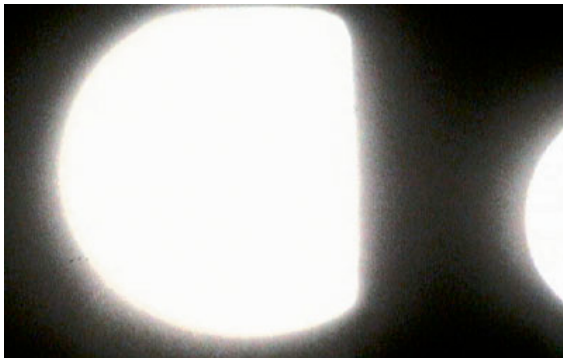
Amy Granat, Holepunch (for O.M.) , 2005 , still from a black-and-white film in 16 mm transferred to video, 1 minute.

And it is the logic of recombination, and the layering of meaning that can come from it, that accounts for the complex address of Granat’s art. If her work in some sense extends the tradition of filmmaking that “creates itself out of its own experience,” to quote curator John G. Hanhardt’s characterization of the tradition of medium-specific cinema that culminated with Structuralist film, it creates itself out of other experiences as well, expanding into other disciplines, other registers. The motif, for example, of an effulgent circle (hole punches, spotlights on walls), which crops up throughout her work, could be linked to blankness, ciphers, to the “zero” in Cinema Zero , to the reduction of film to the barest of terms. But it could also be linked to the moon—a figure Granat invokes in talking about her art, drawing a parallel between its cycles and a looped reel of film. Falling somewhere between Méliès’s iconic fantasy of lunar voyage, the archetypal establishing shots of vampire movies, and McCall’s projector-beam-as-sculpture, Granat’s luminous disks illuminate a cinema that is historical as well as temporal, allegorical as well as material.